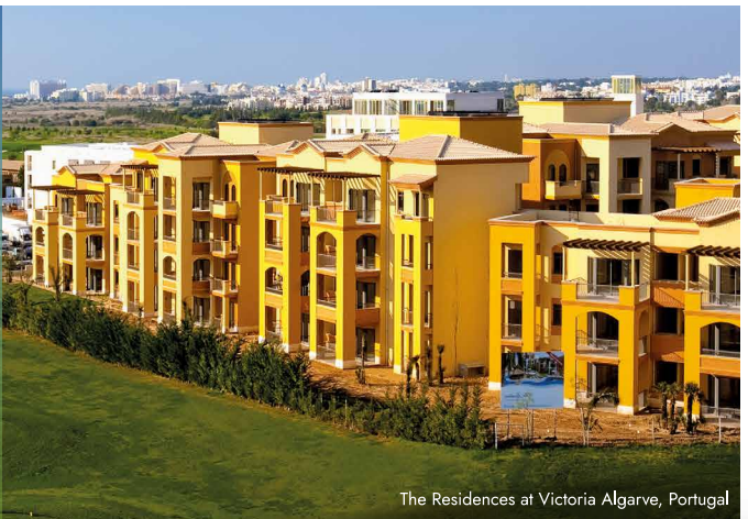
The Residences at Victoria Algarve, Portugal

GHA DISCOVERY is the hotel loyalty programme centred around you, designed to help you savour every occasion, at home or away. Indulge across our 800+ distinct hotels in 100 countries and get VIP recognition, benefits and rewards from Day One.